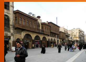
A street in Aleppo before the war