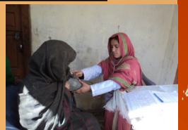
A graduated trainee checks a patients blood pressure

The newly graduated Paramedic Assistants are stationed at a clinic located in their village. These clinics include the remote villages of Torgon, Harikon, Ghawari Giantha, Kuro Satu, Mantho Manthoka, Ghasing Usukhore, Katisho Shamyala, Monjong, Asgharabad, and Thalevillage. The Paramedic Assistants regularly visit the poor and the sick in the villages, using the knowledge and skills they have gained to treat their patients. They are regularly supervised by doctors that travel to each of the ten villages.