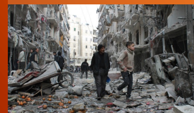
What used to be a residential area in Aleppo

Syria is one of those Middle Eastern countries, which has traditionally been something of an unknown for many years. Its population was about 15.45 million people, with Damascus as the Capital. The different people that occupied Syria over time are: the people of the Stone Age, Phoenicians, Greeks, Romans, Byzantines, early-Islamic dynasties, Ottoman Turks, the British and the French.