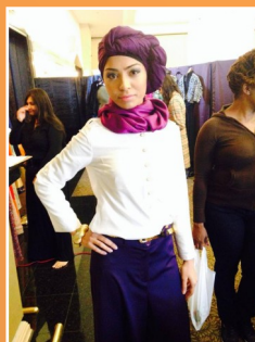
Models on the runway, taking pictures and getting ready to walk the runway

gummy candies, Boutique by Lila with their IndoPak fashion, Exotic Trendz with their outfit accessories and much, much more!