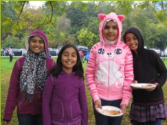
Kids enjoying lunch at the Niagara Falls park.

To cap it all off, we made a short stop at Masjid-an-Noor in St. Catherines along the way. It was a great blessing for us all. It gave