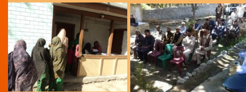
Patients waiting outside the clinic.

The newly graduated Paramedic Assistants are stationed at a clinic located in their village. These clinics include the remote villages of Torgon, Harikon, Ghawari Giantha, Kuro Satu, Mantho Manthoka, Ghasing Usukhore, Katisho Shamyala, Monjong, Asgharabad, and Thalevillage. The Paramedic Assistants regularly visit the poor and the sick in the villages, using the knowledge and skills they have gained to treat their patients. They are regularly supervised by doctors that travel to each of the ten villages.