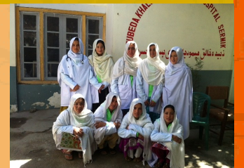
The girls who are undergoing training in paramedics