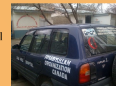
The vehicle used to travel to and from the villages

A vehicle was purchased to enable the Doctors and Paramedic Assistants to travel from the Hospital in Sermik-Skardu, to the remote villages. The villages are visited regularly to monitor the sick and transport those that need special medical care back to the hospital.