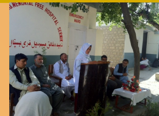
Girls graduate as Paramedic Assistants

These girls were housed and provided meals on the hospital premises.