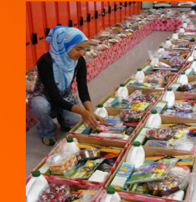
Packing Ramadhan food hampers